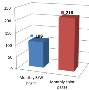
Color/Mono Pages Printed

This provides your printed page volumes for the previous month for both B/W and color print jobs. In addition, a utilization percentage is calculated by comparing your print volume for each printer to the maximum monthly volume capacity for that printer model.